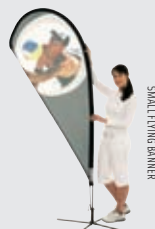
SMALL FLYING BANNER