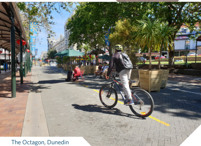
The Octagon, Dunedin