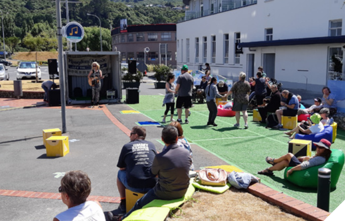
Andrews Ave, Lower Hutt