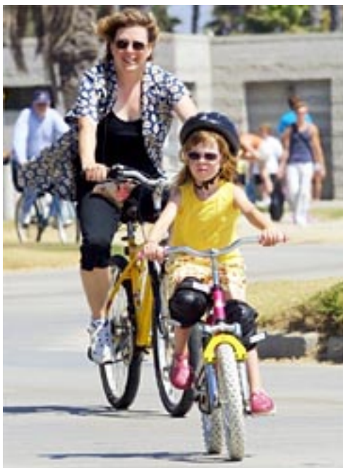
Two bicyclists, one without a helmet and the other wearing hers improperly, go for an afternoon ride on a Santa Monica, Calif., bike path.