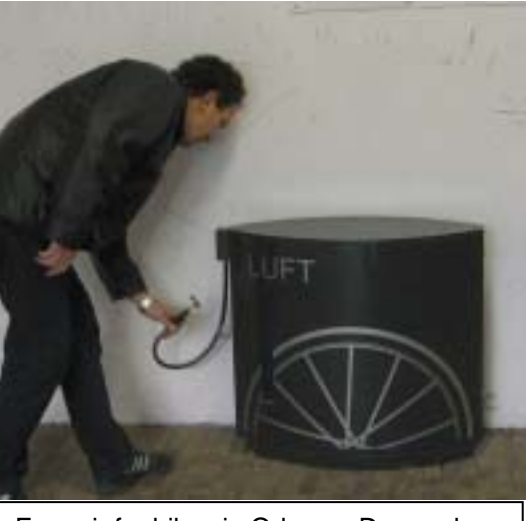
Free air for bikes in Odense, Denmark