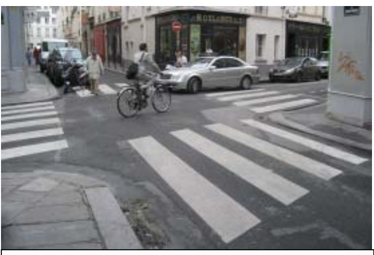
Liberal use of pedestrian crossings in Paris encourage more walking and cycling