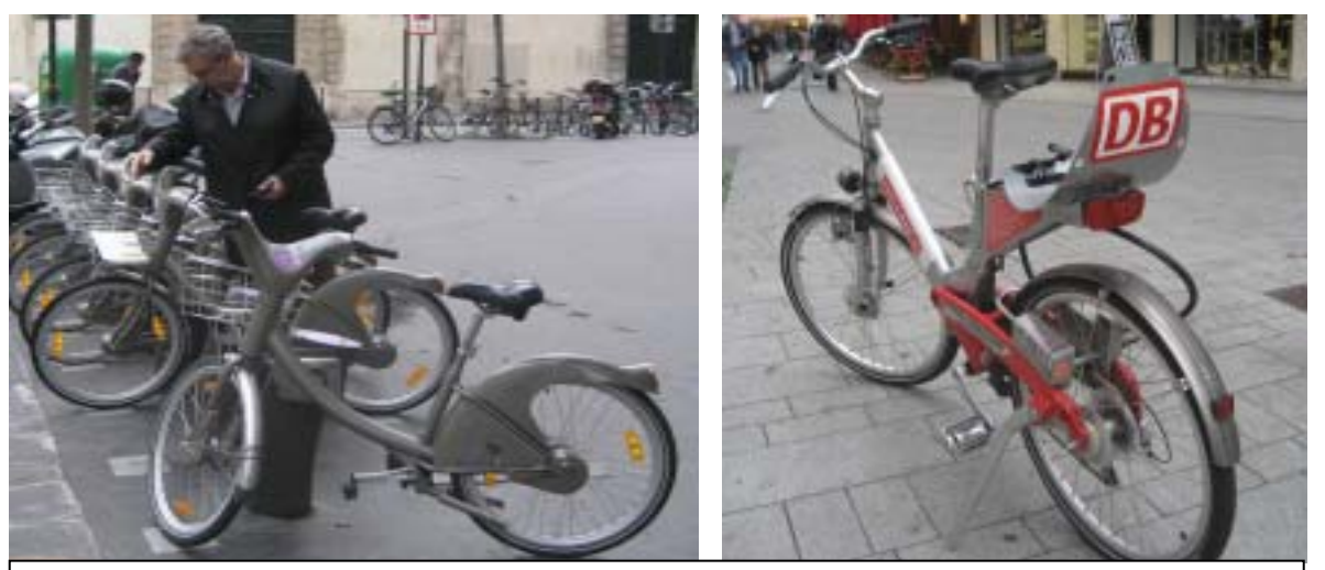
City bikes complement walking and public transport in Paris and Cologne.

New cycling infrastructure requires marketing promotion to maximise its use. Travel behaviour change programs and events (such as Family bike days and cycling breakfasts) are regarded as essential tools for growing the number of cyclists.